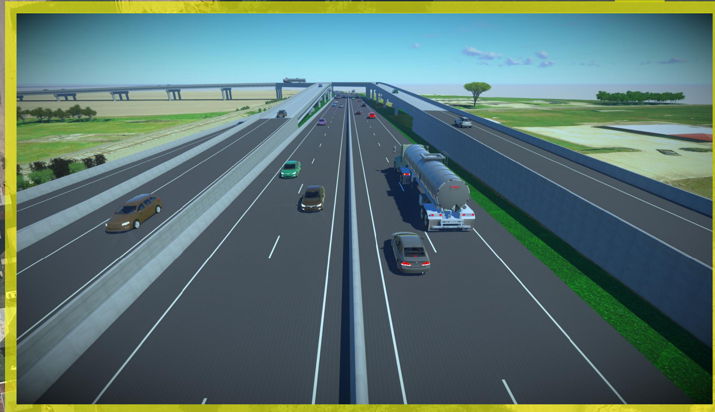
LA 1 LOOKING NORTH